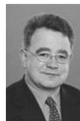
Seán O Fearghaíl (FF)